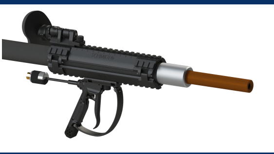
BAABS Long Rail Assembly w/ Electric G3 Trigger Deadman & Adjustable Brace