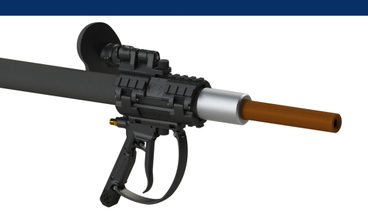
BAABS Short Rail Assembly w/ Pneumatic G3 Trigger Deadman & Adjustable Brace