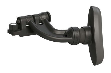
Can be configured for left or right-handed blasting