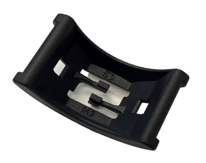
Blast Hose Gripper